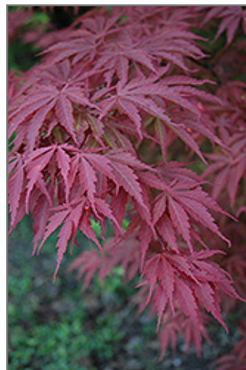
Chitose Yama Japanese Maple foliage

Chitose Yama Japanese Maple will grow to be about 15 feet tall at maturity, with a spread of 15 feet. It has a low canopy with a typical clearance of 2 feet from the ground, and is suitable for planting under power lines. It grows at a medium rate, and under ideal conditions can be expected to live for 60 years or more.