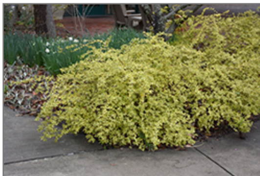
Twist of Lime Glossy Abelia

Twist of Lime Glossy Abelia is recommended for the following landscape applications;