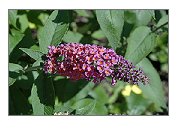
Bicolor Butterfly Bush flowers

This stunning shrub is the first butterfly bush ever to offer two completely different colors on the same flower stalk, along with fantastic fragrance that attracts butterflies; great for perennial borders, patio planters, or as a garden accent