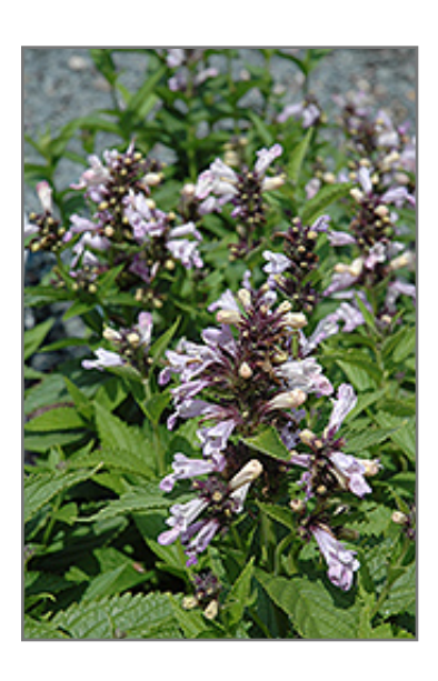
Candy Cat Catmint flowers

Candy Cat Catmint has masses of beautiful spikes of lightly-scented lavender flowers rising above the foliage from early to mid summer, which emerge from distinctive rose flower buds, and which are most effective when planted in groupings. Its attractive small glossy pointy leaves remain dark green in color throughout the season.