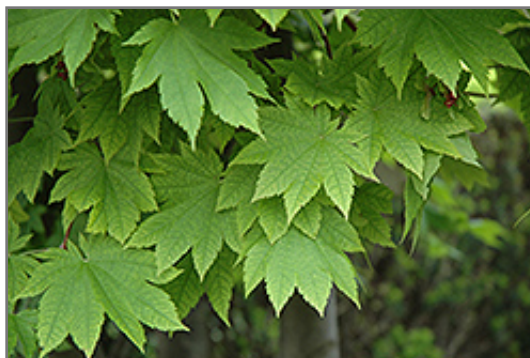
Vitifolium Fullmoon Maple foliage