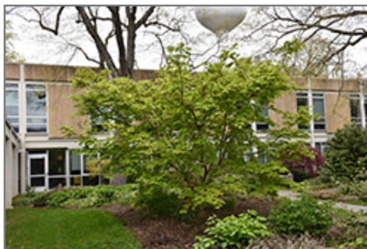
Vitifolium Fullmoon Maple