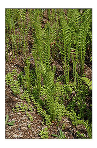
Interrupted Fern foliage

Interrupted Fern is primarily valued in the landscape or garden for its cascading habit of growth. It features bold spikes of brown flowers rising above the foliage in mid summer. Its enormous oval bipinnately compound leaves are lime green in color. The foliage often turns tan in fall.