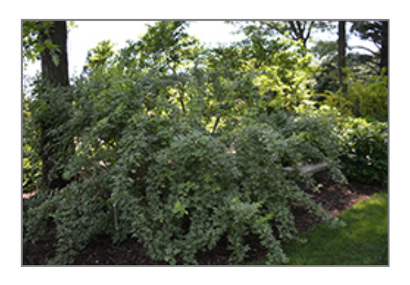
Variegated Fiveleaf Aralia

This shrub will require occasional maintenance and upkeep, and can be pruned at anytime. Gardeners should be aware of the following characteristic(s) that may warrant special consideration;