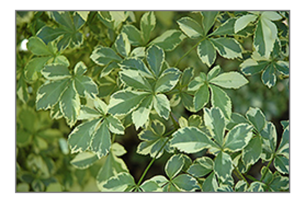
Variegated Fiveleaf Aralia foliage

The Variegated Fiveleaf Aralia is a multi-stemmed deciduous shrub with an upright spreading habit of growth. Its average texture blends into the landscape, but can be balanced by one or two finer or coarser trees or shrubs for an effective composition.