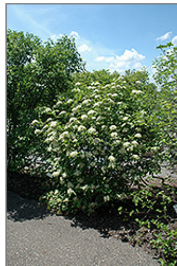
Witherod Viburnum in bloom