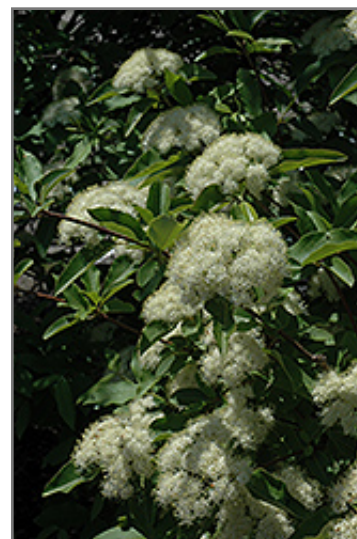
Witherod Viburnum flowers