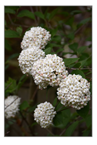
Fragrant Viburnum flowers

Fragrant Viburnum is recommended for the following landscape applications;