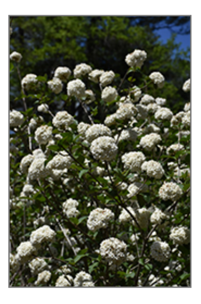
Fragrant Viburnum flowers

This shrub does best in full sun to partial shade. It prefers to grow in average to moist conditions, and shouldn't be allowed to dry out. It is not particular as to soil type or pH. It is highly tolerant of urban pollution and will even thrive in inner city environments. This particular variety is an interspecific hybrid.