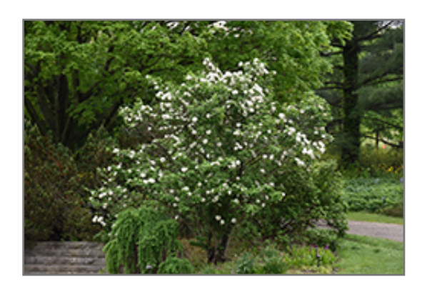
Fragrant Viburnum in bloom