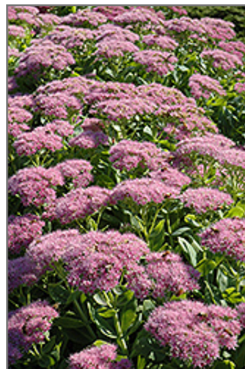
Brilliant Stonecrop flowers