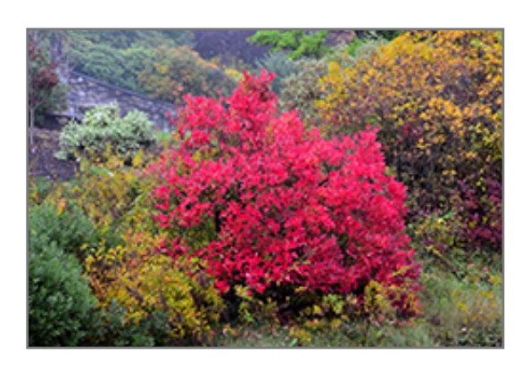
Highbush Blueberry in fall