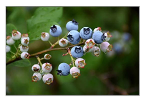
Highbush Blueberry fruit