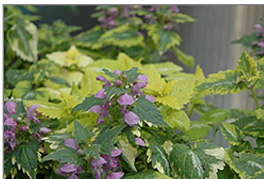
Anne Greenaway Spotted Dead Nettle flowers