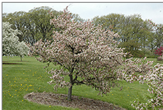
Leprechaun Flowering Crab in bloom