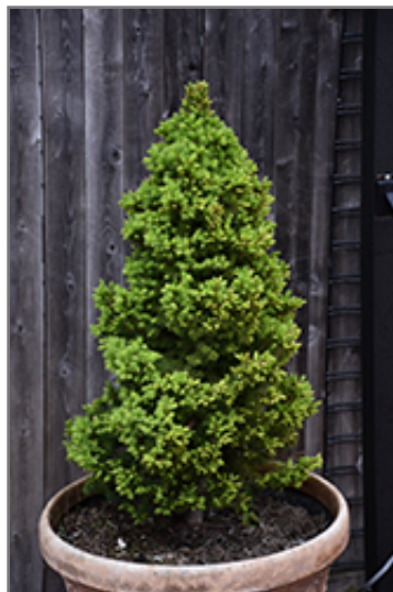
Rainbow's End Spruce