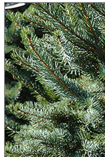
Brun's Spruce foliage