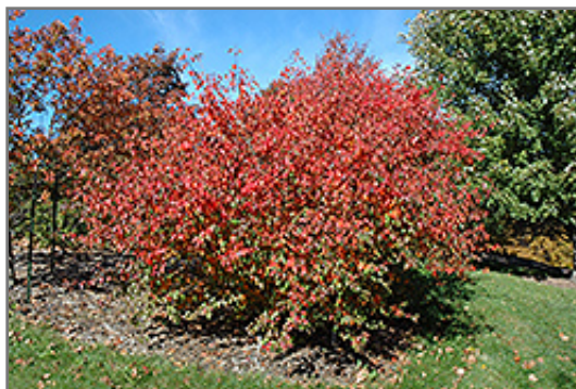
Korean Sun Pear in fall

Korean Sun Pear will grow to be about 15 feet tall at maturity, with a spread of 20 feet. It has a low canopy with a typical clearance of 2 feet from the ground, and is suitable for planting under power lines. It grows at a medium rate, and under ideal conditions can be expected to live for 50 years or more.