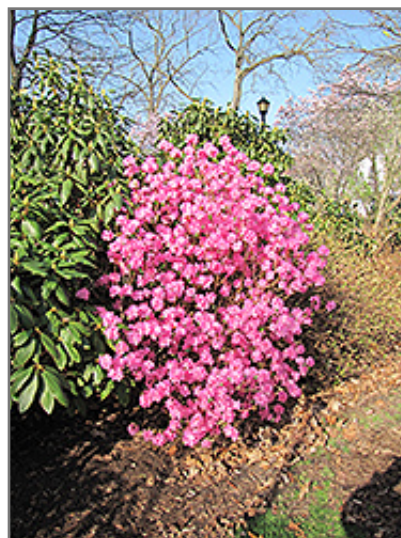
Landmark Rhododendron in bloom