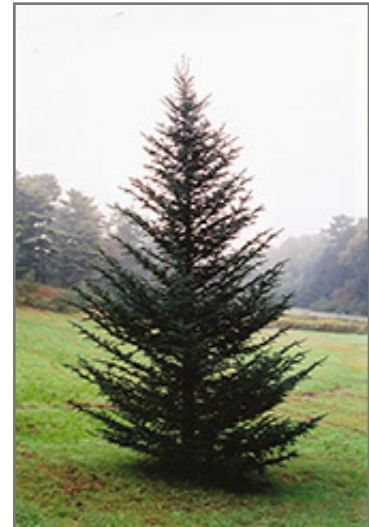
Fraser Fir

Fraser Fir will grow to be about 35 feet tall at maturity, with a spread of 20 feet. It has a low canopy, and should not be planted underneath power lines. It grows at a slow rate, and under ideal conditions can be expected to live for 70 years or more.