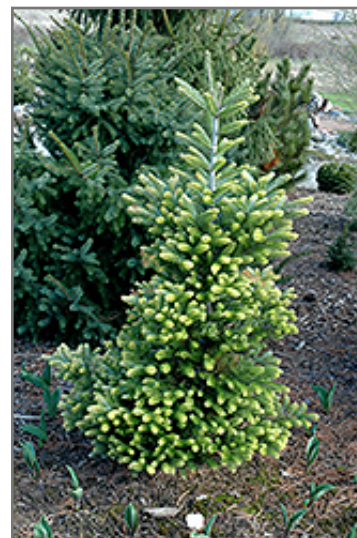
Golden Korean Fir