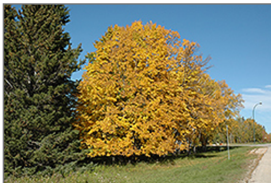
American Linden in fall