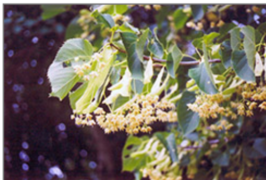
American Linden flowers