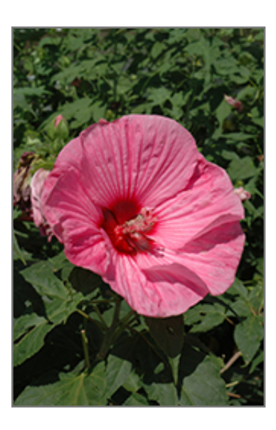
Plum Crazy Hibiscus flowers

This bold garden perennial features showy ruffled, lavender-pink flowers w/dark-red eye; attractive, glossy, large, dark-green/bronze leaves; ideal for the mixed garden border or in mass; do not allow to dry to wilting point