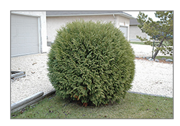
Woodwardii Arborvitae

An extremely popular landscape evergreen, forms a dense ball shape without pruning, eventually grows quite large, excellent for use in home landscapes; hardy and very tough, best with some sun, protect from drying winds