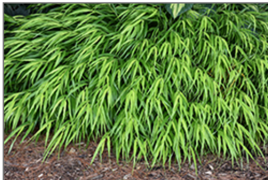
All Gold Hakone Grass foliage