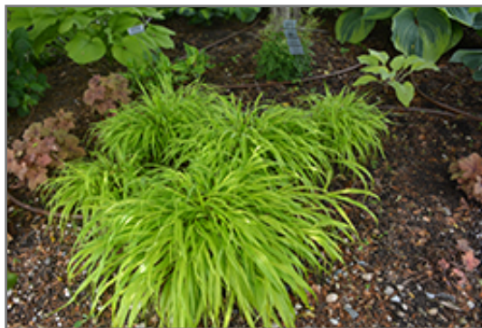
All Gold Hakone Grass