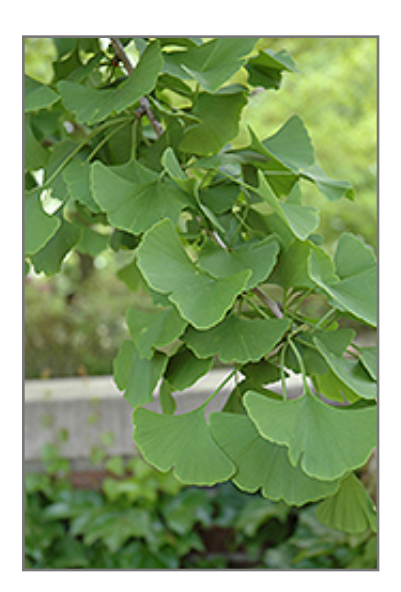
Magyar Ginkgo foliage