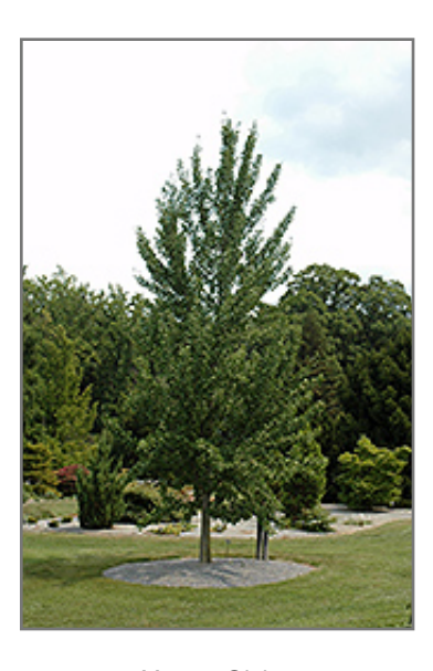
Magyar Ginkgo