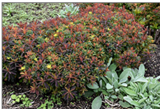
Bonfire Cushion Spurge