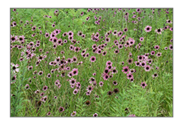
Tennessee Coneflower in bloom