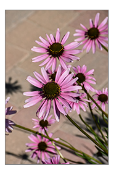
Tennessee Coneflower flowers

This plant does best in full sun to partial shade. It is very adaptable to both dry and moist growing conditions, but will not tolerate any standing water. It is considered to be drought-tolerant, and thus makes an ideal choice for a low-water garden or xeriscape application. It is not particular as to soil type or pH. It is somewhat tolerant of urban pollution. This species is native to parts of North America. It can be propagated by division.