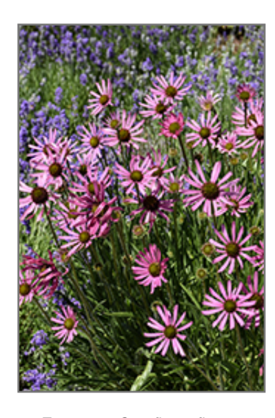
Tennessee Coneflower flowers

Tennessee Coneflower is recommended for the following landscape applications;