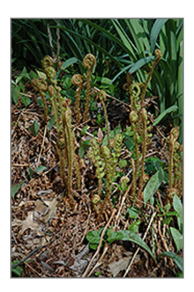
Robust Male Fern in spring

Robust Male Fern is recommended for the following landscape applications;