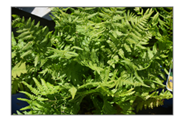
Robust Male Fern foliage

This is a relatively low maintenance plant, and should be cut back in late fall in preparation for winter. Deer don't particularly care for this plant and will usually leave it alone in favor of tastier treats. It has no significant negative characteristics.