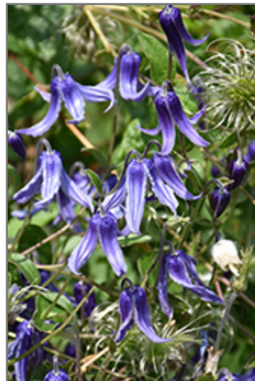
Solitary Clematis flowers