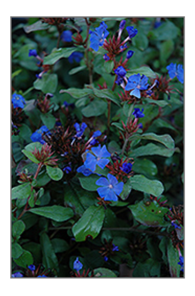
Plumbago flowers

This is a relatively low maintenance plant, and is best cleaned up in early spring before it resumes active growth for the season. It is a good choice for attracting bees and butterflies to your yard. It has no significant negative characteristics.