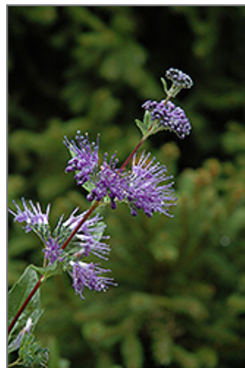
Blue Mist Caryopteris flowers