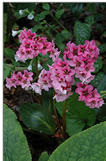
Pink Dragonfly Bergenia flowers