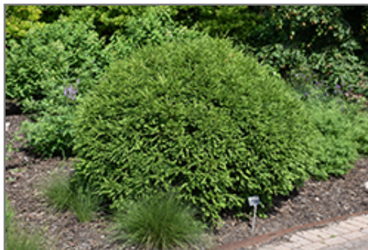
Green Gem Boxwood