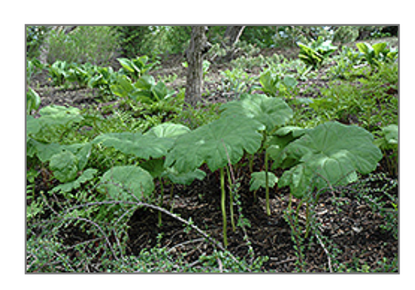
Astilboides foliage