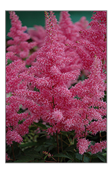
Rhythm and Blues Astilbe flowers

Soft, showy plumes of raspberry pink, rising above glossy leaves; perfect in a shady spot with dappled light; prefers moisture so water regularly for abundant flowers and nice foliage