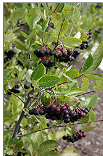
Iroquois Beauty Black Chokeberry fruit