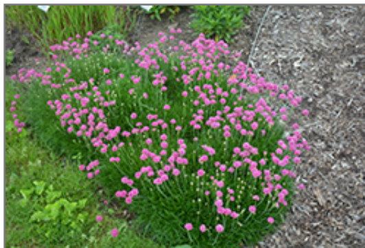
Bloodstone Sea Thrift in bloom