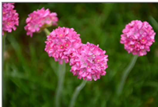
Bloodstone Sea Thrift flowers

Bloodstone Sea Thrift will grow to be only 6 inches tall at maturity extending to 10 inches tall with the flowers, with a spread of 18 inches. Its foliage tends to remain low and dense right to the ground. It grows at a slow rate, and under ideal conditions can be expected to live for approximately 10 years. As an evergreen perennial, this plant will typically keep its form and foliage year-round.