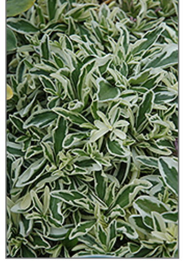
Variegated Wall Cress foliage