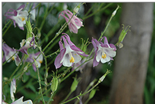
Common Columbine flowers

Common Columbine is recommended for the following landscape applications;