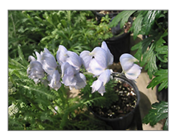
Stainless Steel Monkshood flowers

This showy perennial is popular for its remarkable metallic-blue spikes of flowers and attractive glossy green leaves; prefers to be planted in part-shade locations; Stainless Steel is compact and sturdy enough that it should not require staking