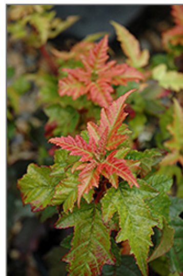
Atomic Amur Maple in fall