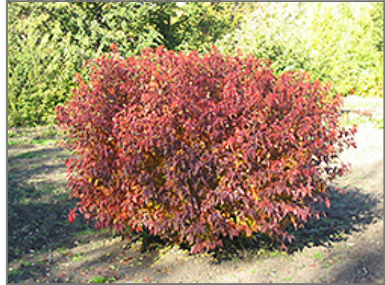
Atomic Amur Maple in fall

This shrub does best in full sun to partial shade. It is very adaptable to both dry and moist locations, and should do just fine under average home landscape conditions. It is not particular as to soil type or pH. It is highly tolerant of urban pollution and will even thrive in inner city environments. This is a selected variety of a species not originally from North America.