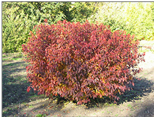
Atomic Amur Maple in fall

This shrub does best in full sun to partial shade. It is very adaptable to both dry and moist locations, and should do just fine under average home landscape conditions. It is not particular as to soil type or pH. It is highly tolerant of urban pollution and will even thrive in inner city environments. This is a selected variety of a species not originally from North America.