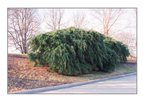
Sargent's Weeping Hemlock