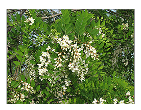
Black Locust flowers