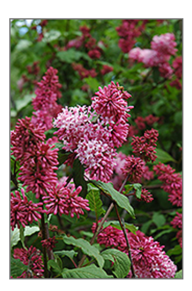
Nocturne Lilac flowers

One of the most attractive lilacs yet quite rare, produces rich pink flowers which open from wine red buds, the contrast in each flower head is shocking; a superb specimen plant, plant in full sun and well-drained soil; non-suckering