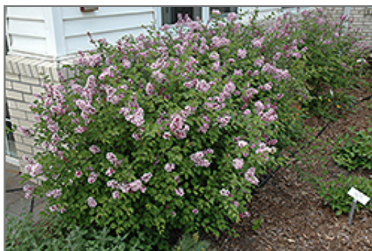
Prince Charming Lilac in bloom