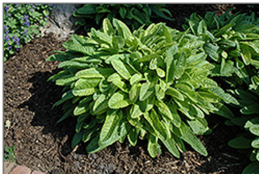
Hummelo Betony