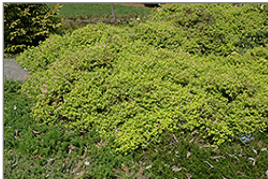
Golden Elf Spirea

Golden Elf Spirea is recommended for the following landscape applications;