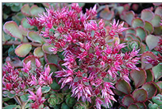
Fulda Glow Stonecrop flowers