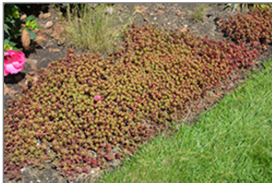
Fulda Glow Stonecrop

Fulda Glow Stonecrop is a fine choice for the garden, but it is also a good selection for planting in outdoor pots and containers. Because of its spreading habit of growth, it is ideally suited for use as a 'spiller' in the 'spiller-thriller-filler' container combination; plant it near the edges where it can spill gracefully over the pot. Note that when growing plants in outdoor containers and baskets, they may require more frequent waterings than they would in the yard or garden.