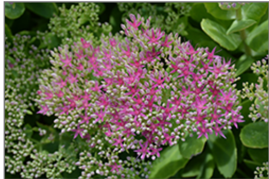
Neon Stonecrop flower buds

Neon Stonecrop is a fine choice for the garden, but it is also a good selection for planting in outdoor pots and containers. With its upright habit of growth, it is best suited for use as a 'thriller' in the 'spiller-thriller-filler' container combination; plant it near the center of the pot, surrounded by smaller plants and those that spill over the edges. Note that when growing plants in outdoor containers and baskets, they may require more frequent waterings than they would in the yard or garden.