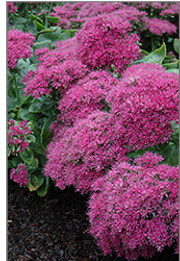
Neon Stonecrop flowers

Neon Stonecrop is recommended for the following landscape applications;