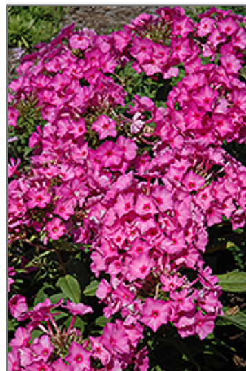
Flame Pink Garden Phlox flowers