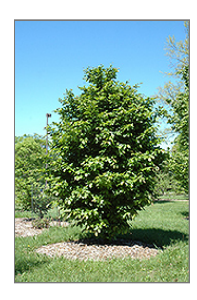
Vanessa Parrotia

This is a relatively low maintenance shrub, and should not require much pruning, except when necessary, such as to remove dieback. It has no significant negative characteristics.