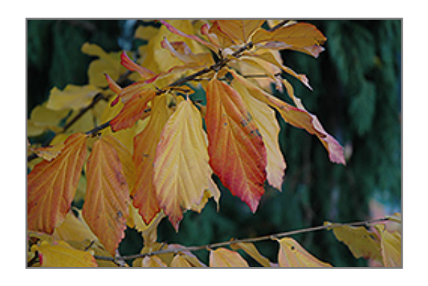
Vanessa Parrotia in fall

Vanessa Parrotia is recommended for the following landscape applications;